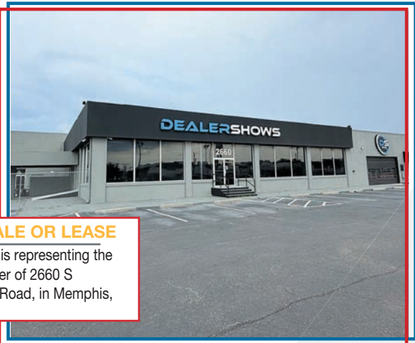
FOR SALE OR LEASE Brian Califf is representing the landlord/seller of 2660 S Mendenhall Road, in Memphis, TN.